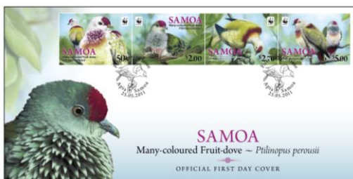
First Day Cover